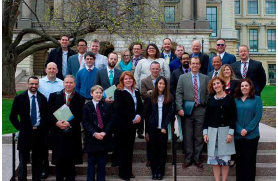
ICEP Advocacy Day participants convene on the steps of the State Capitol before beginning legislative visits to discuss key emergency medicine issues.