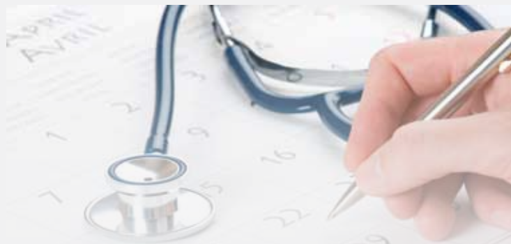
EXHIBIT & SPONSORSHIP BENEFITS

Exhibiting at an ICEP event brings you face-to-face with key decision-makers who evaluate your products and services and utilize them in daily practice at emergency departments across the nation.