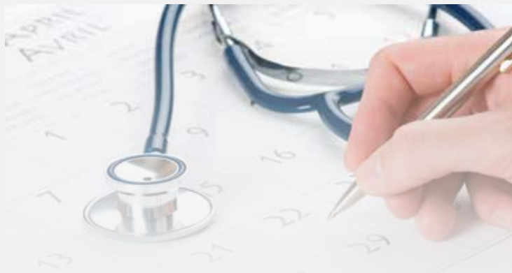
EXHIBIT & SPONSORSHIP BENEFITS

Exhibiting at an ICEP event brings you face-to-face with key decision-makers who evaluate your products and services and utilize them in daily practice at emergency departments across the nation.