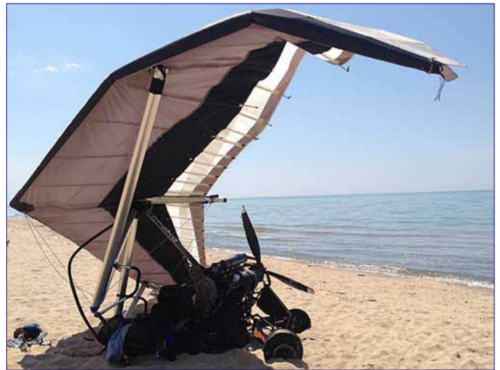
Figure 1: The scene of the ultralight plane crash on the beach.

At the scene were bystanders and police officers trying to help a just-arriving EMT-P and his EMT partner. The scene was a remote, limited access beach fronting a steep forest preserve bluff. No one on the beach appeared to be injured. The ultralight aircraft had been piloted by two males. The smaller adolescent was partially pinned and underneath the larger middle-aged