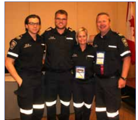
Winners of the 2013 ITLS Competition, the team from Niagara EMS #2 in Canada.

The 2014 conference will be held November 5-7 in Cleveland, Ohio. We hope many from ITLS Illinois will be able to join us!