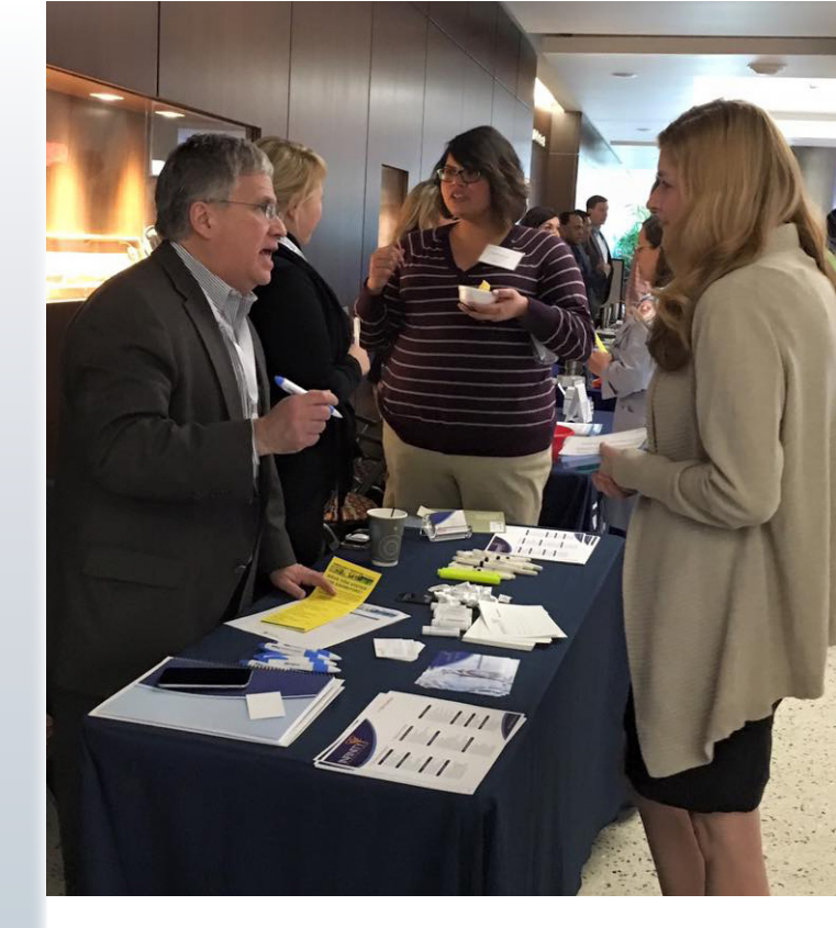
Exhibit rates vary by program. See costs on Pages 4-7.