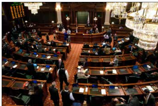
ABOVE LEFT: The residents and faculty from the SIU emergency medicine program gathered inside the capitol to begin making contacts with legislators. ABOVE RIGHT: A view of the Senate chamber on ICEP Advocacy Day.