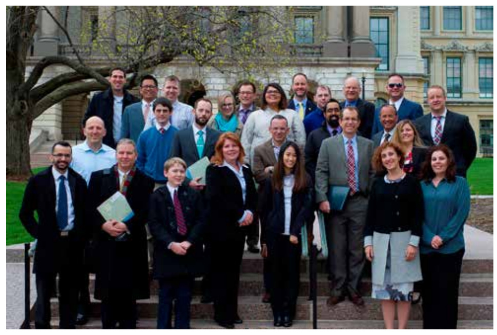
ICEP Advocacy Day participants convene on the steps of the State Capitol before beginning legislative visits to discuss key emergency medicine issues.