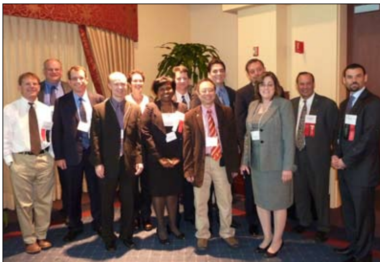
The members of the ICEP Board of Directors pose together after elections results were announced at the 2011 Spring Symposium at Northwestern Memorial Hospital.