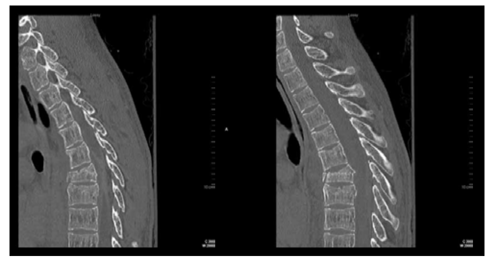
Figure 1: Thoracic MRI scan of a skydiver who landed in a retention pond on his knees and presented complaining of left side pain.

logical status. Based on his mechanism of injury and assessment, what should be in your differential thought process?