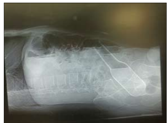
Figure 2: A retained foreign body

abdominal pain, fever and peritonitis. Treatment for retained foreign bodies (Figure 2) includes sedation and local anesthesia to overcome the "vacuum effect" created within the rectum from the retained foreign body. Rectal and colonic perforations are treated with primary surgical repair and possible colostomy.