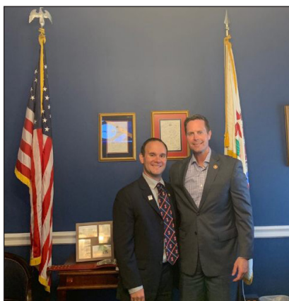
BOTTOM: Thank you to all the ICEP members who attend ACEP LAC and represented Illinois emergency physicians.