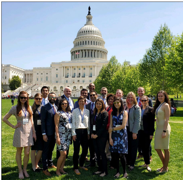
TOP: Members of the Illinois delegation at ACEP LAC on Capitol Hill before meeting with legislators.

Members also educated legislators about the importance of protecting emergency patients from surprise bills that result from the deceptive practice of "balance billing." Congress is encouraged to take patients out of the middle of billing disputes by adopting a proven process that encourages insurers and providers to negotiate fairly. Prohibiting balance billing protects the patient as long as there is a fair and independent mechanism to resolve billing disputes. An arbitration process is recommended as a solution to incentivize providers to charge reasonable rates and insurers to pay appropriate amounts. Improved transparency on benefits, deductibles, and out-of-pocket expenses are also necessary