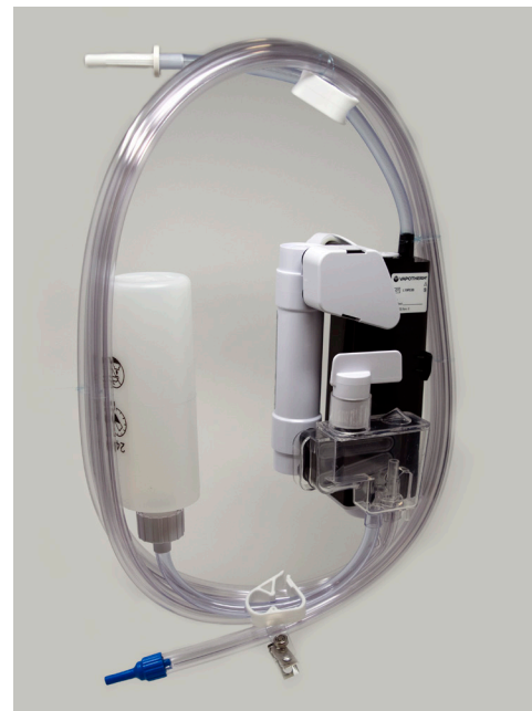
Pre-Assembled for Clinician Convenience

1. DiBlasi RM. Clinical Controversies in Aerosol Therapy for Infants and Children. Respiratory Care 2015;60(6):894-914; discussion 914-896. Data available upon request