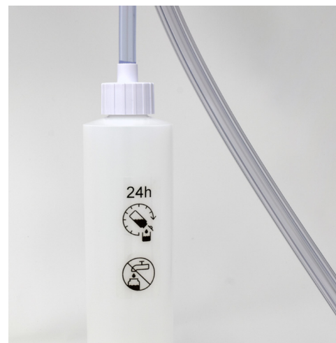
Minimal Rainout and Condensate Management