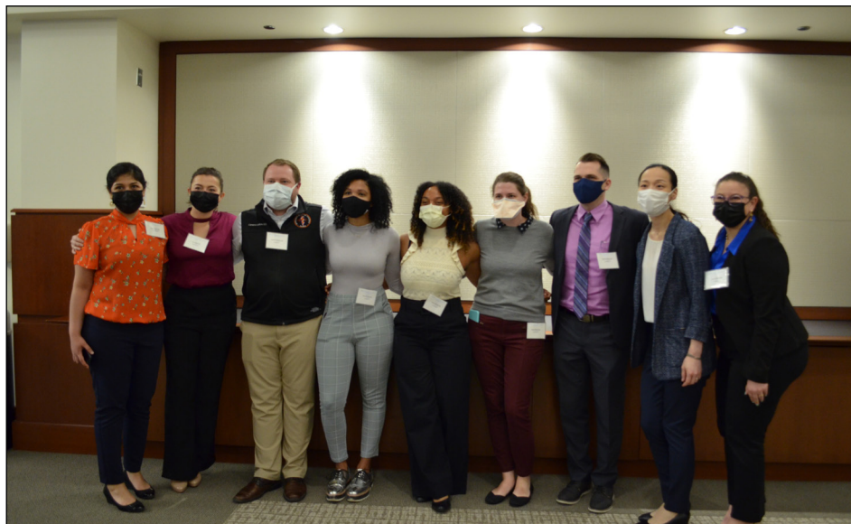
Resident Speaker Forum Presenters