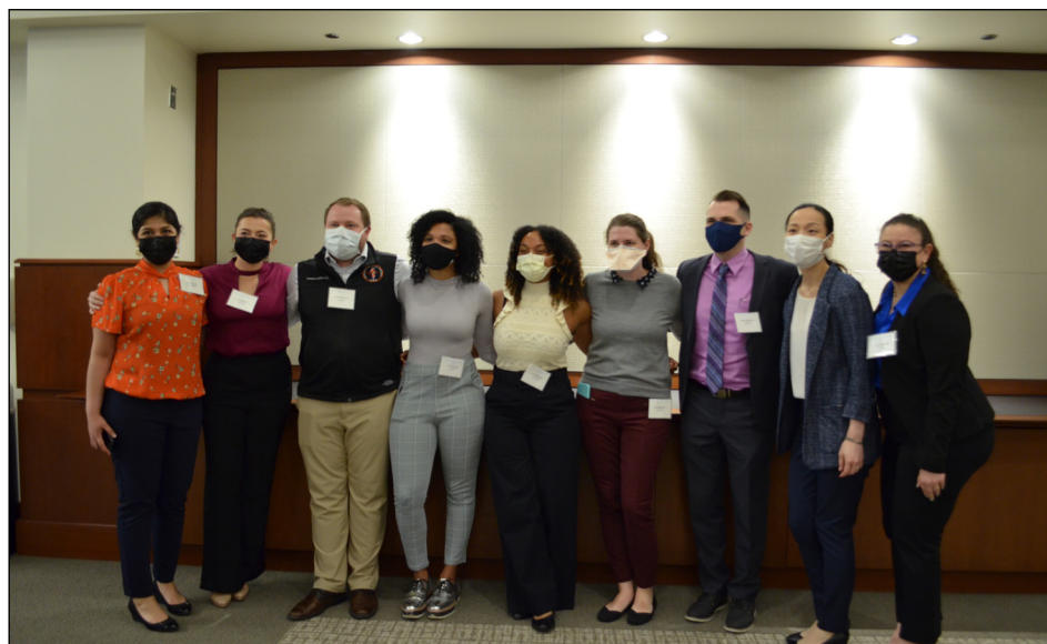
Resident Speaker Forum Presenters